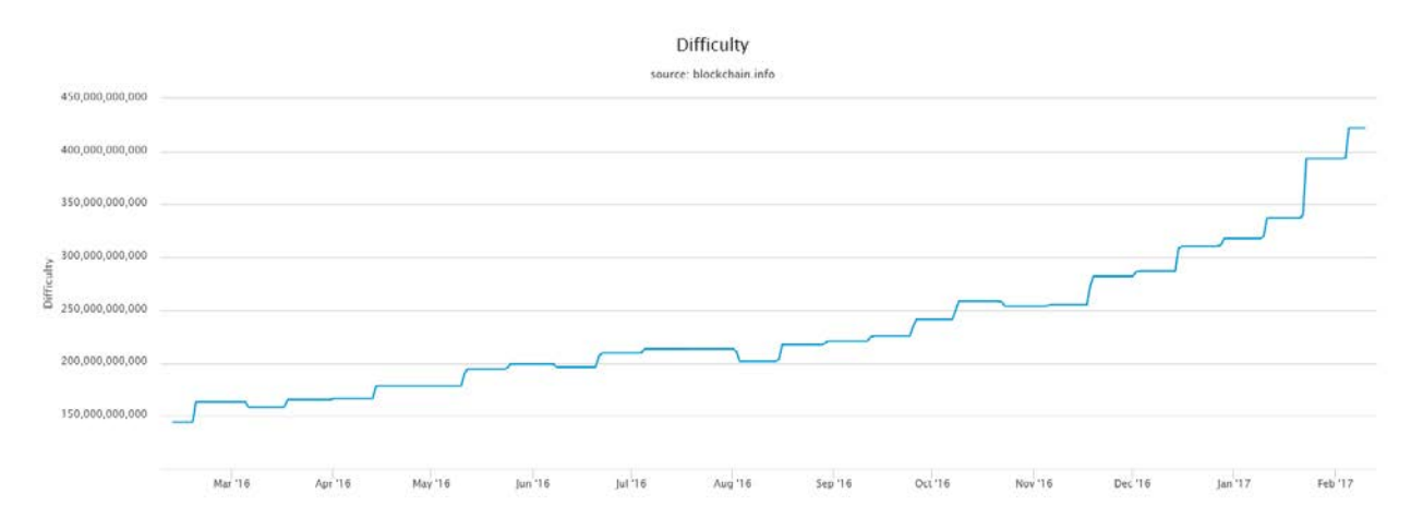
Table 2: Difficulty - A relative measure of how difficult it is to find a new block. The difficulty is adjusted periodically as a function of how much hashing power has been deployed by the network of miners

In addition, the consumption of resources necessarily keeps increasing because the level of difficulty for adding a new block rises as a consequence of the increase in computing power within the network.<sup>22</sup>